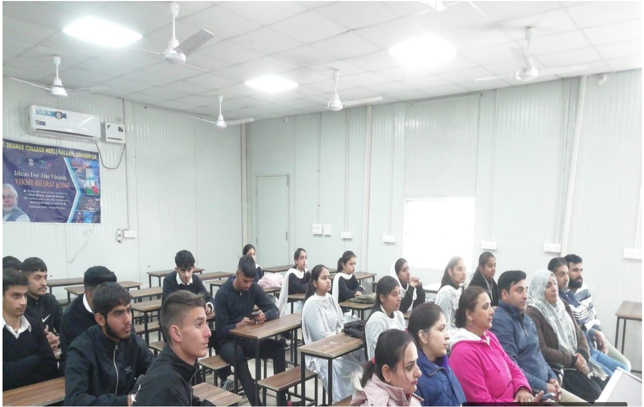
National Youth Day (Red Ribbon Activity)