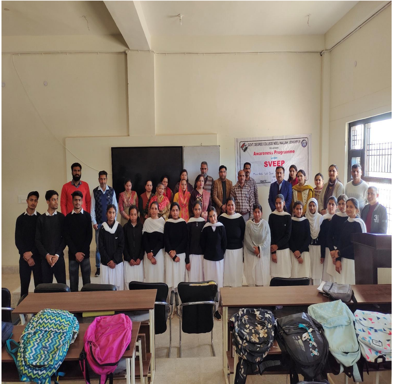
Activities Under SVEEP