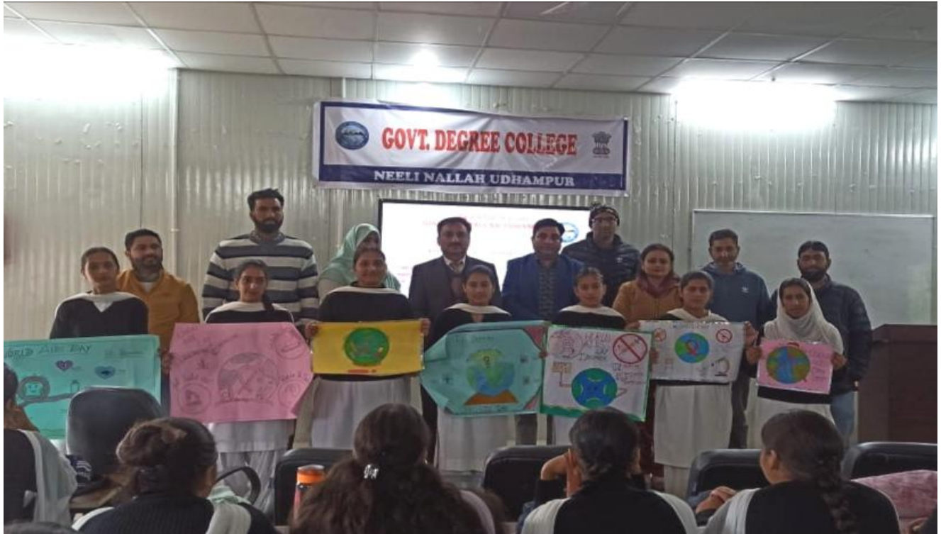
World's AIDS Day (Red Ribbon Activity)