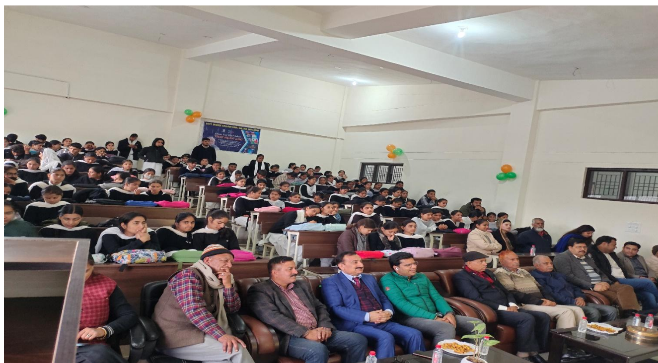
Online Inauguration of newly constructed college building