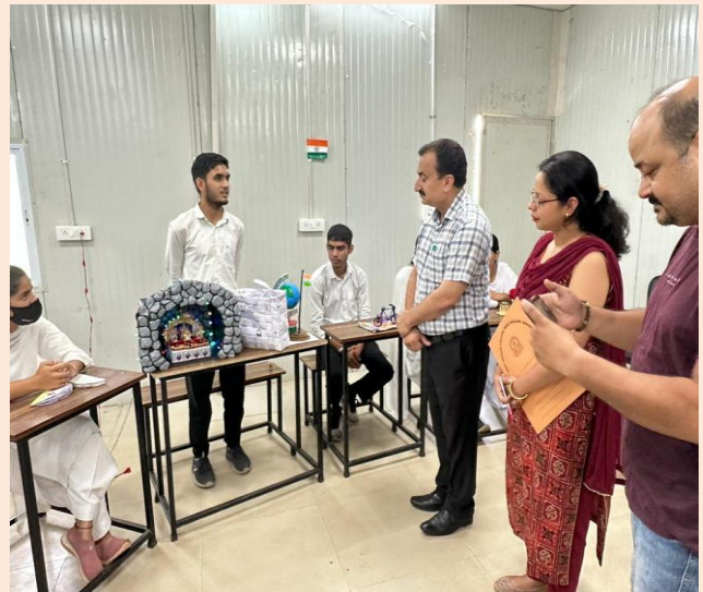
International Youth Day (Red Ribbon Activity)