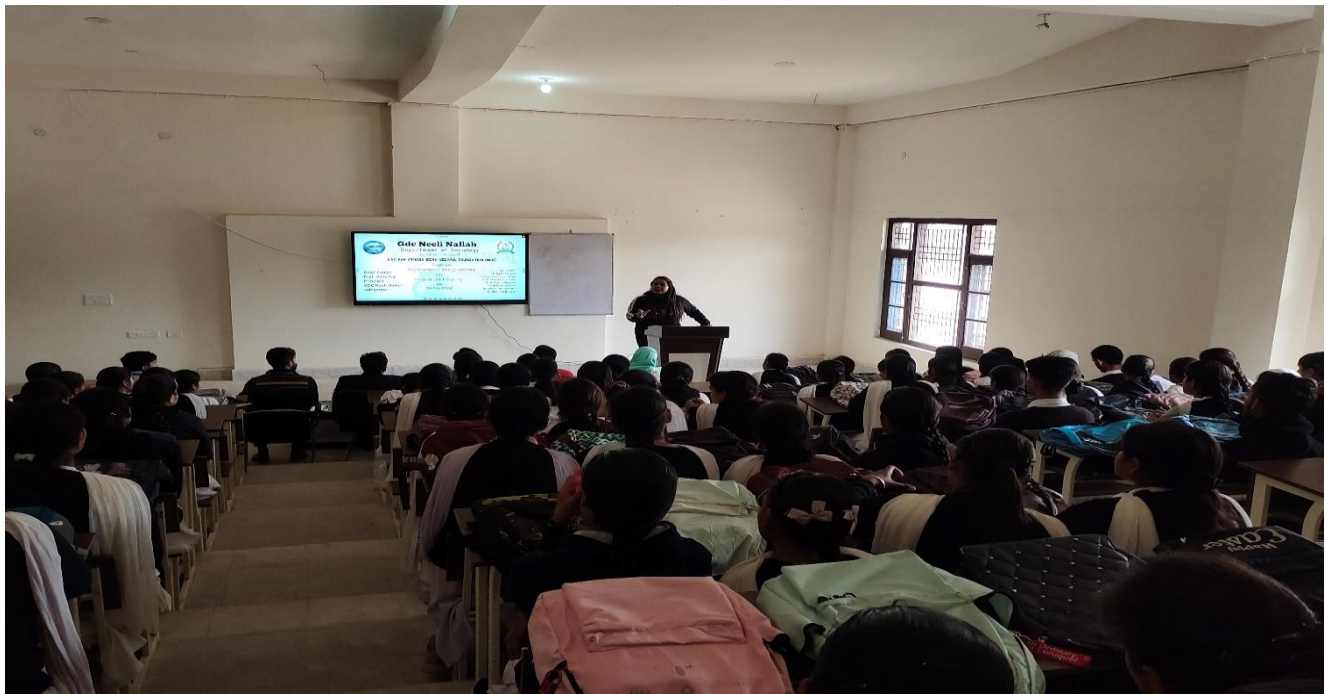
Awareness Program on Menstruation a Taboo in Society