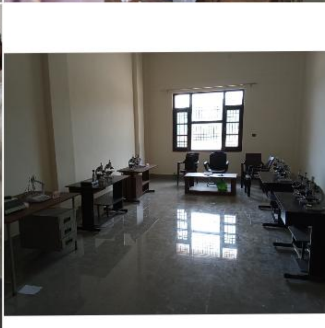
Evs Lab: The college has well established Evs lab.