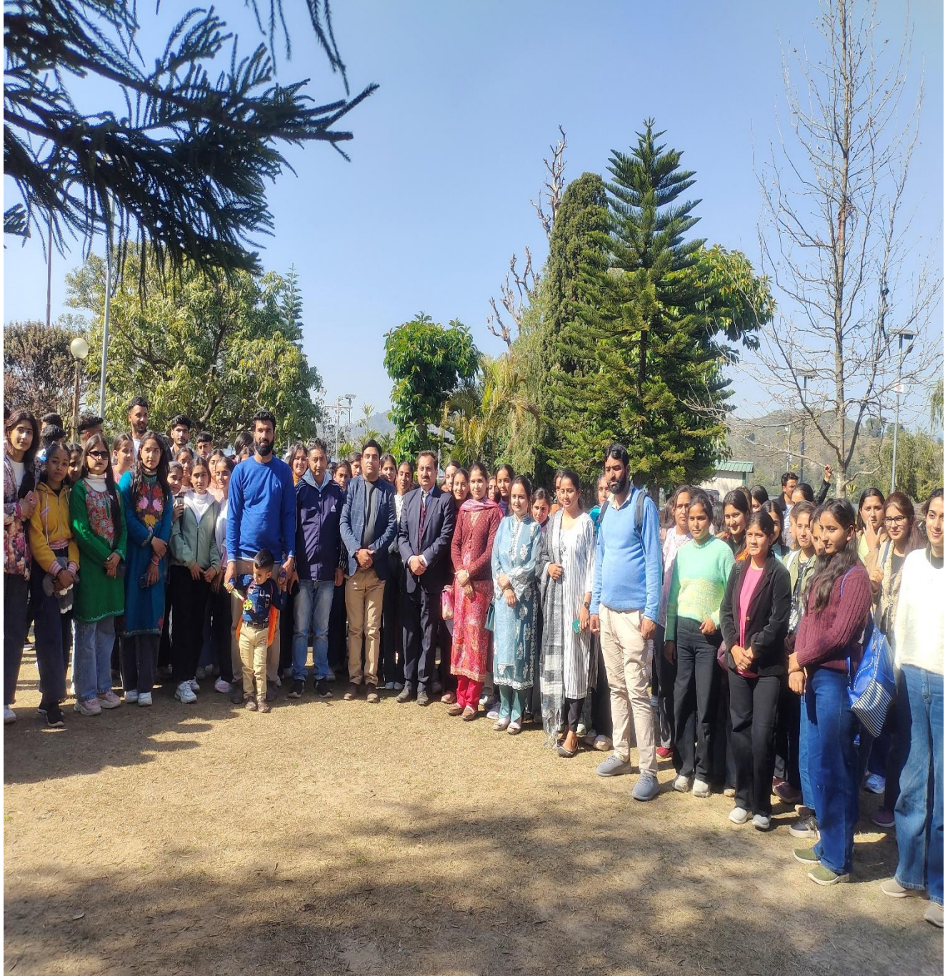
COLLEGE PICNIC AT MANSAR