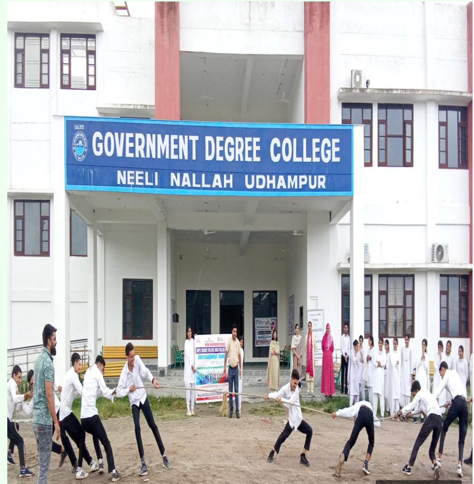
Activities conducted under Red Ribbon Club